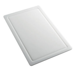
HDPE Chopping board 8657 001